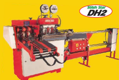
Double head stitcher