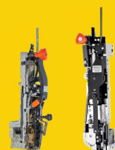
8mm 20mm Hohner compatible head